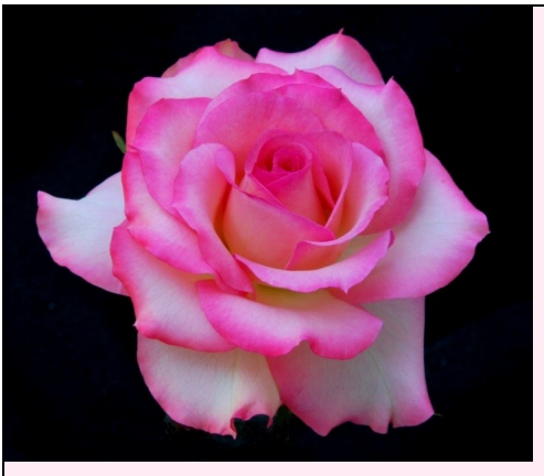
'Foolish Pleasure' Photo by Gretchen Humphrey 2015 PNW District Photo Contest