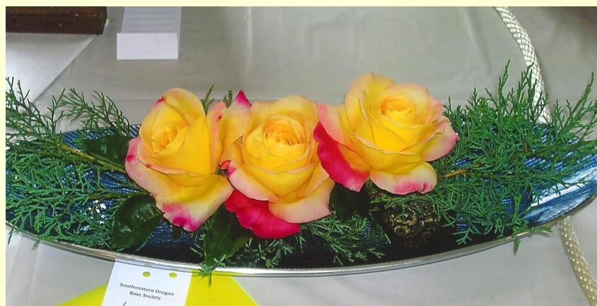
'Roses on the River'