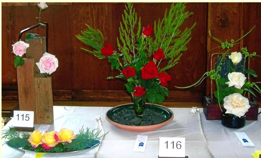
'Arrangements-Coquille Rose Show'

Deadline for making a reservation for any of these 10 rooms blocked for our show is Friday, May 13, 2016. Individual District members will be responsible for his/her room, applicable tax and incidental expenses.