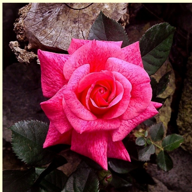
2015 PNW District Photo Contest